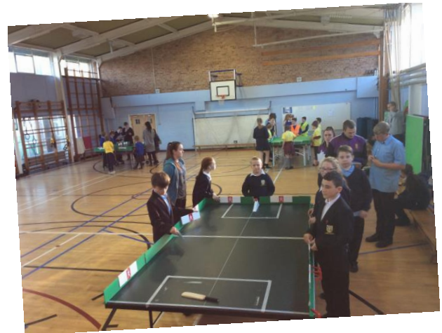
Table Cricket Competition

On the 20th November Clare Mount not only hosted the Wirral School Games Table Cricket competition but we also competed and officiated. The event saw 6 primary schools and 2 secondary schools compete in a tense afternoon of Table Cricket. The quality of umpiring from the Sports Leaders was superb. The students thoroughly enjoyed themselves. 7G represented Clare Mount who drew with Lingham Primary winning 2 games each. The next progression of the competition is to represent Wirral at a County final in the New Year. Well done to 7G and our fantastic Sports Leaders we wish them the best of luck in the next stage of the competition.