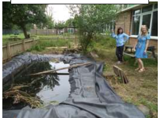
Water in and plank to let anything that falls in get out!