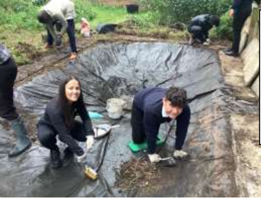
Final brush up of stones and twigs