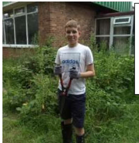
Cutting back brambles nearby