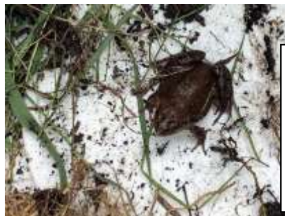
Rescuing creatures along the way!