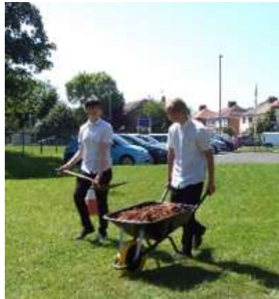
Moving sand for laying new slabs