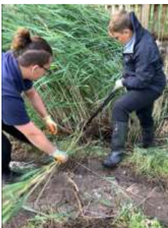
Working together to clear old reeds