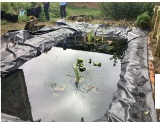
New pond plants in – a nearly finished pond.