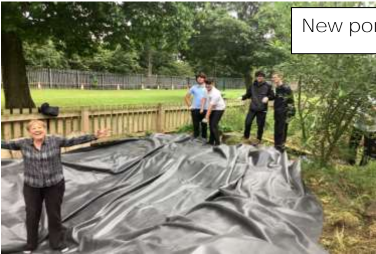
New pond liner finally in place!