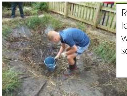
Removing left over water and soil