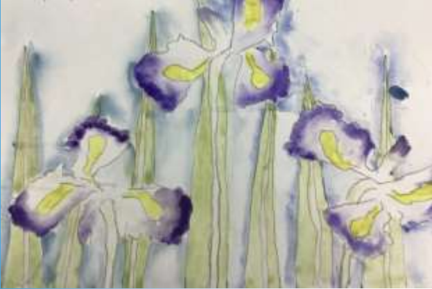
Iris Flowers 3 Callum Christiansen Watercolour, 27.5cm x 39.5cm