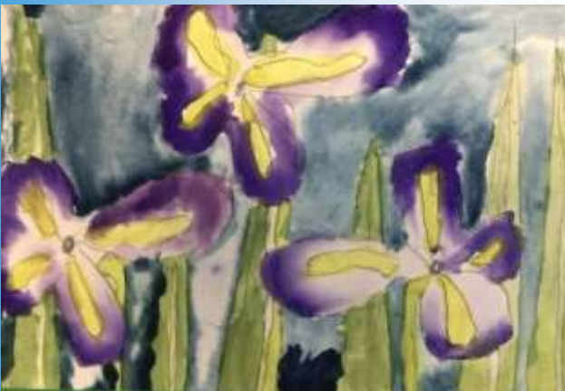
Iris Flowers 2 Rhiannon Hughes Watercolour, 25.5cm x 38cm