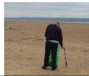
Litter picking at Red Rocks