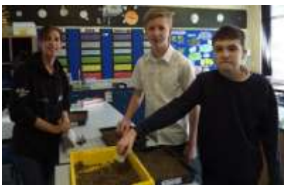
Planting Sea Holly seeds