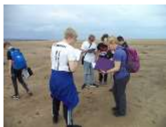
Shell identification on Hoylake beach