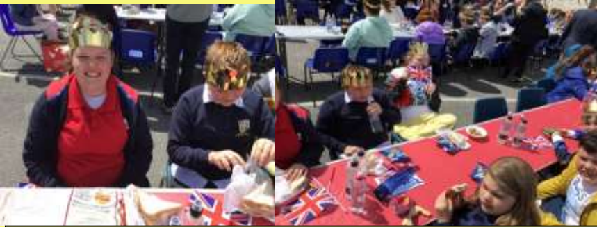
9SF enjoying our Jubilee party