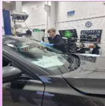
Lewis - Merseyside Car Hospital