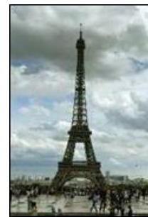
Year 10 & Sixth Form: Bi-annual Trip to Paris