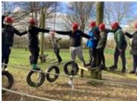
Duke of Edinburgh expedition