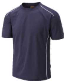
PERFORMANCE T SHIRT