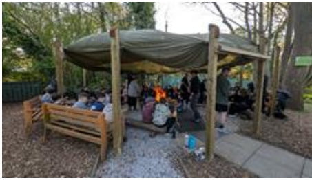
Year 7 Chester Zoo & Barnstondale

Every student has the chance to participate in a residential trip during their time at Clare Mount. There is a strong emphasis on developing leadership, team-building and independence skills through our Outdoor Education and Adventurous Activity experiences. The school follows the Wirral Authority policy on voluntary contributions for school activities.