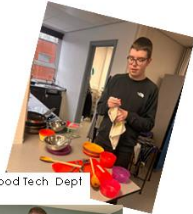
Leasowe Primary; Empowered Gym; School Food Tech Dept