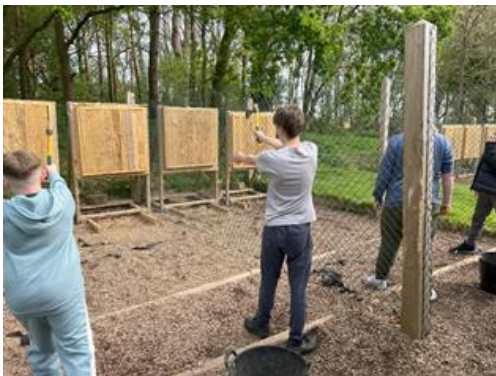
Year 9 Boreatton Park