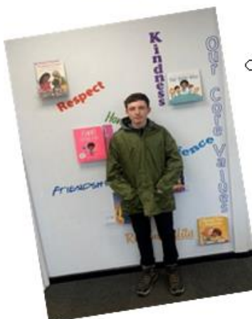
Castleway Primary; Sainsbury's, Heswall