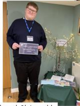
Moreton Carpet Shop; The Entertainer, Birkenhead; St Joseph's Catholic Primary School