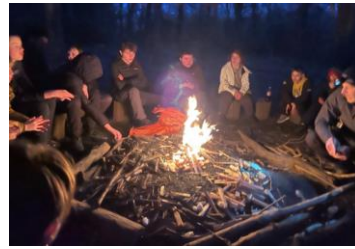
Year 8 Conway Centre, Anglesey