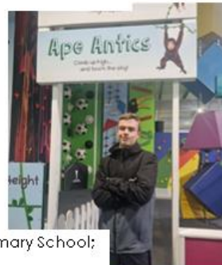
Co-op Academy Woodslee Primary; Fender Primary School; Activity For All