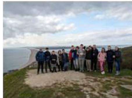
Year 10 GCSE Geography Field Trip, Osmington Bay